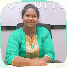
K SHINEY PGDCA - 2019 HR, Adwath Algorithm 2.4 LPA